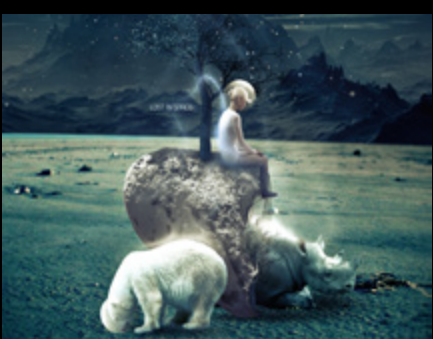
DESIGN: MOE PIKE SOE