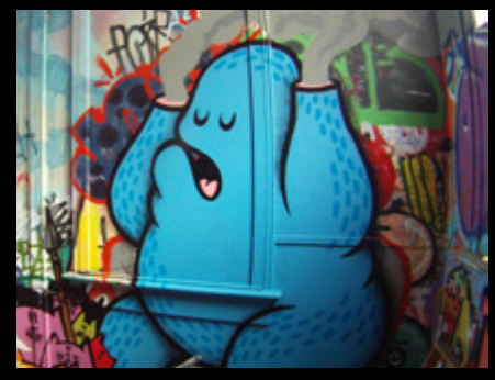
DESIGN: PROJEKT C