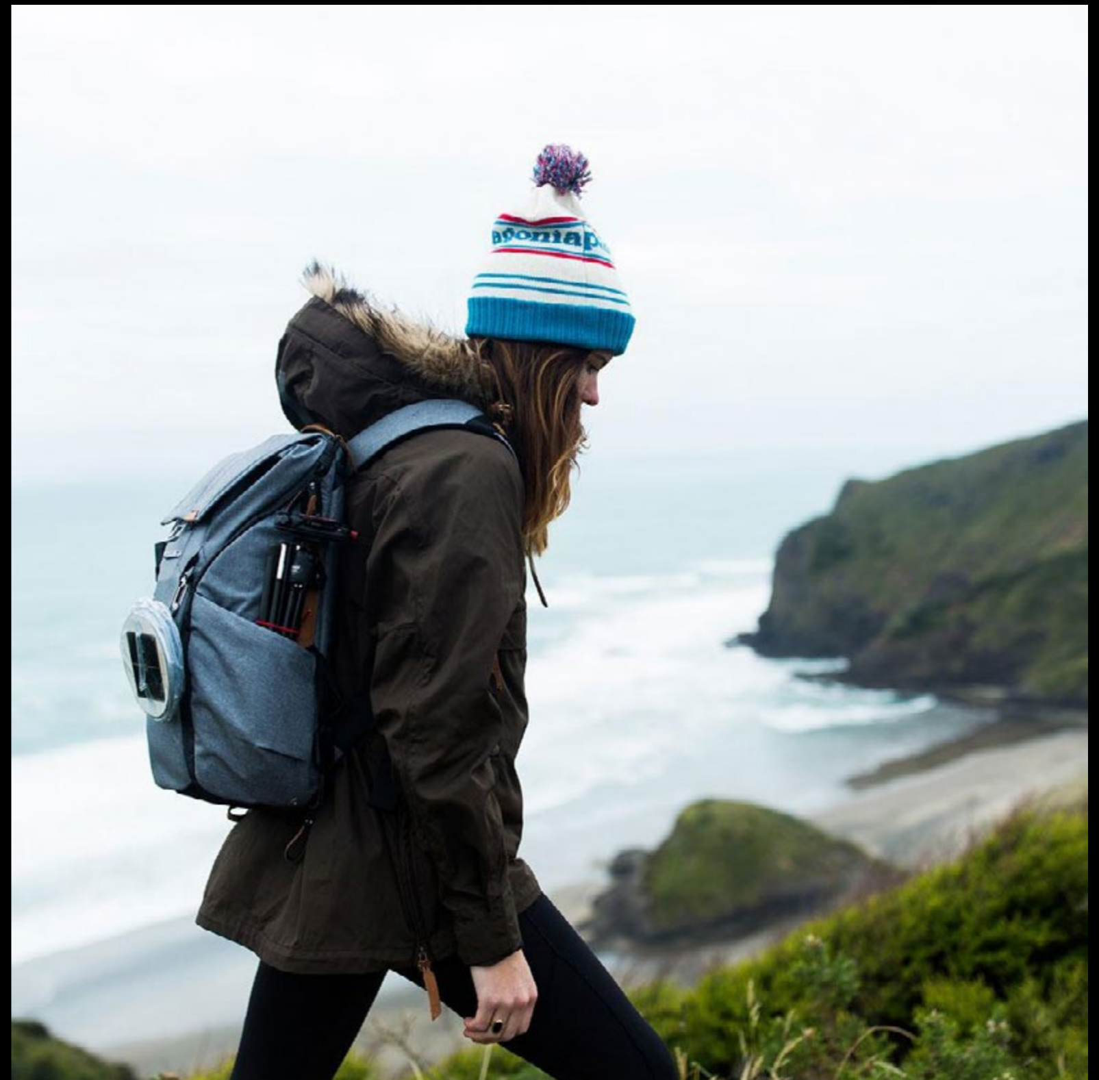
Peak Design: Everyday Backpack

https://getinspiredmagazine.com/resources