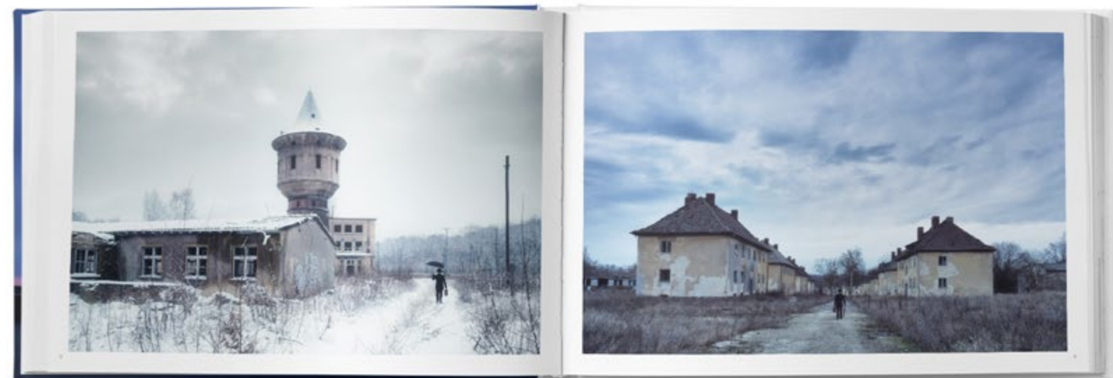
Ralph Gräf: The Traveller