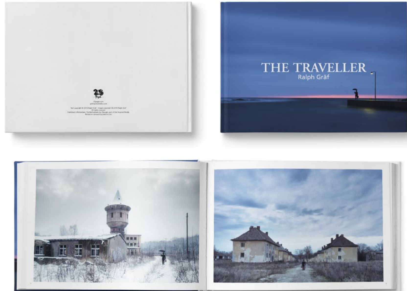
Ralph Gräf: The Traveller