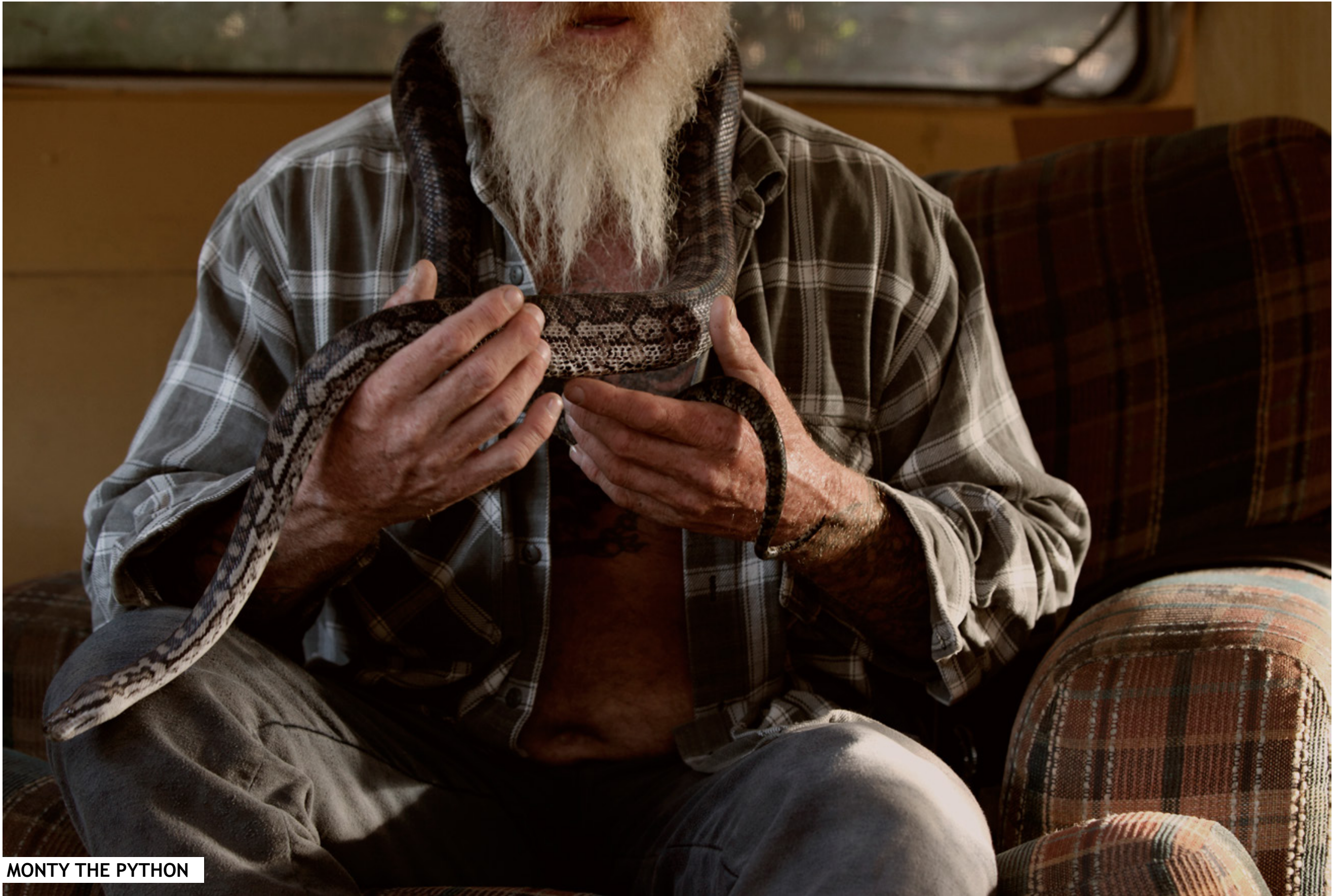
MONTY THE PYTHON