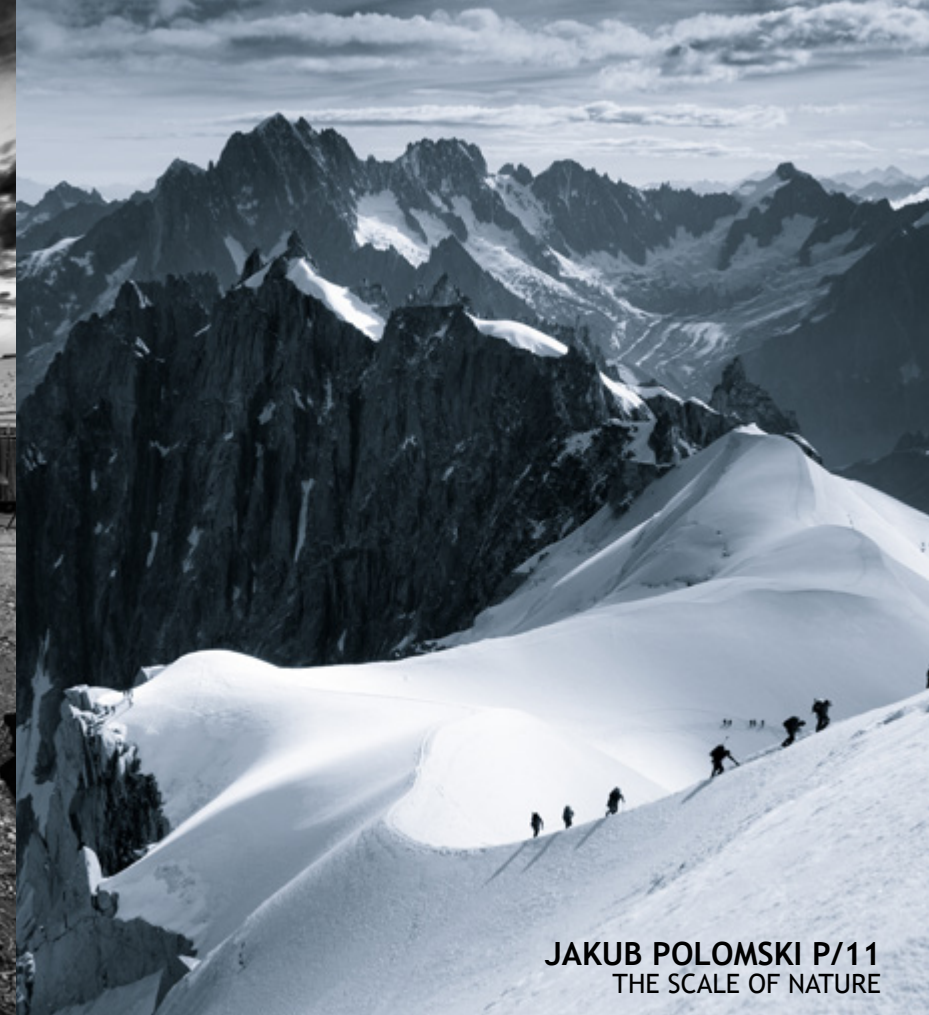
JAKUB POLOMSKI P/11 THE SCALE OF NATURE