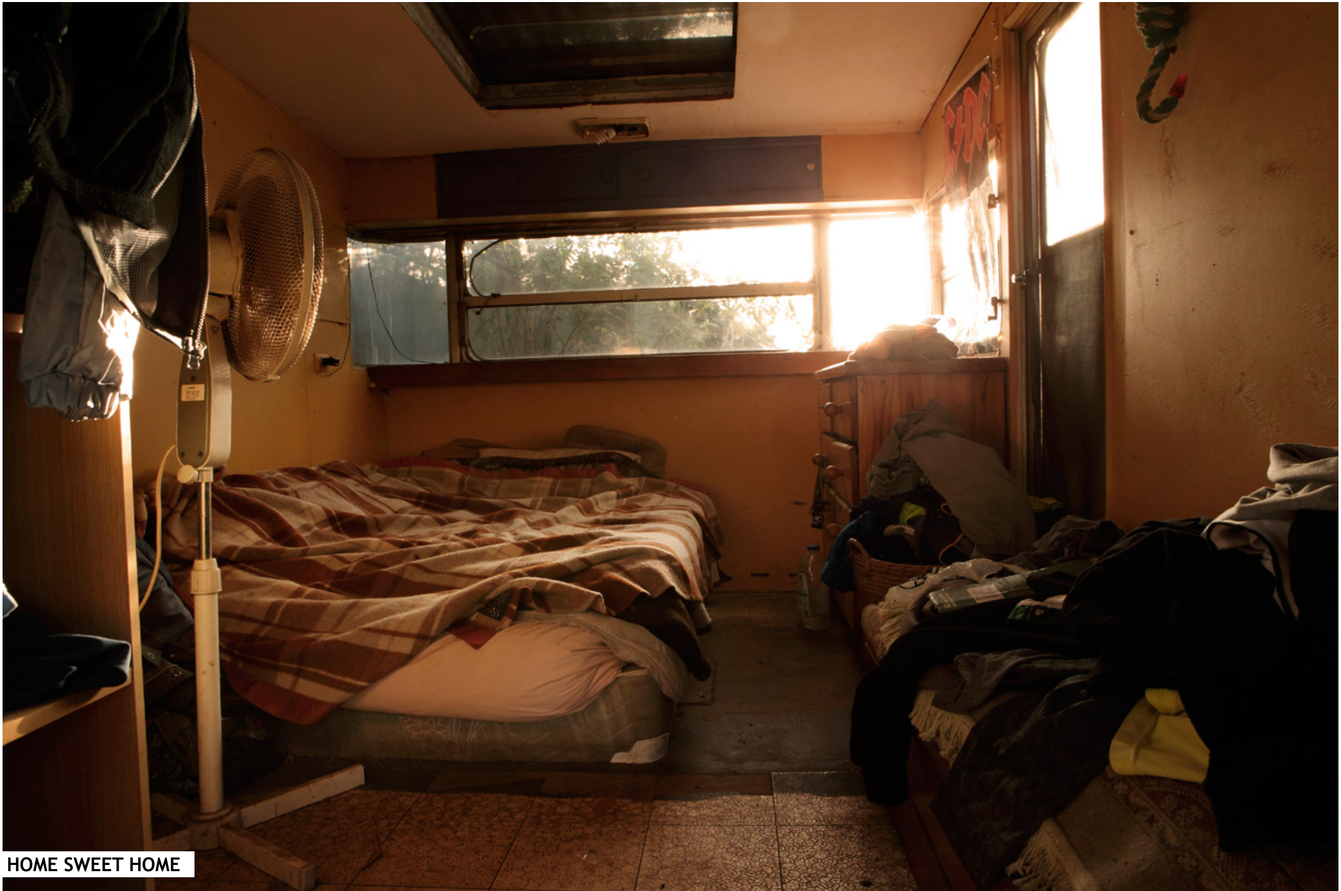
HOME SWEET HOME