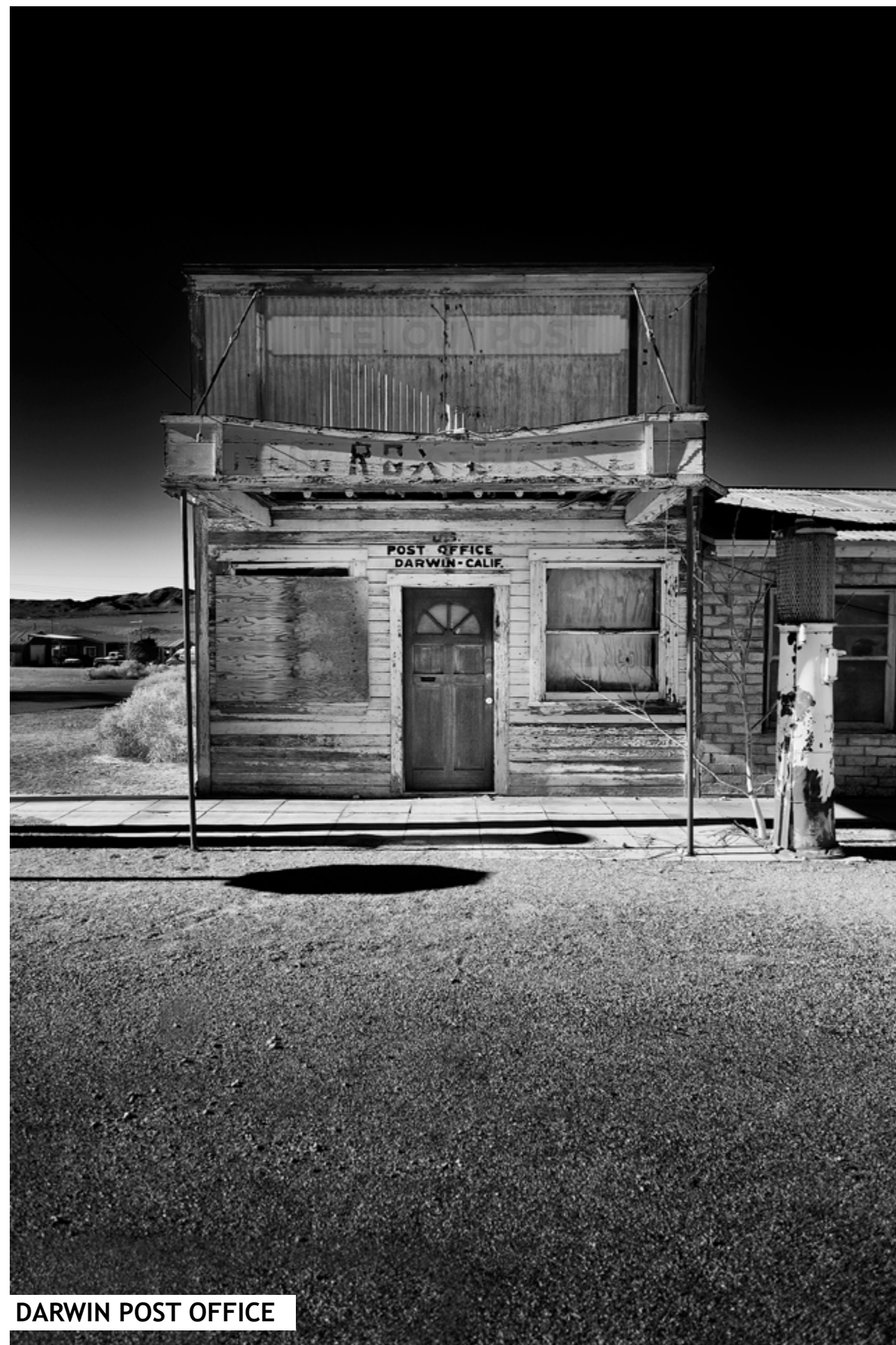
DARWIN POST OFFICE