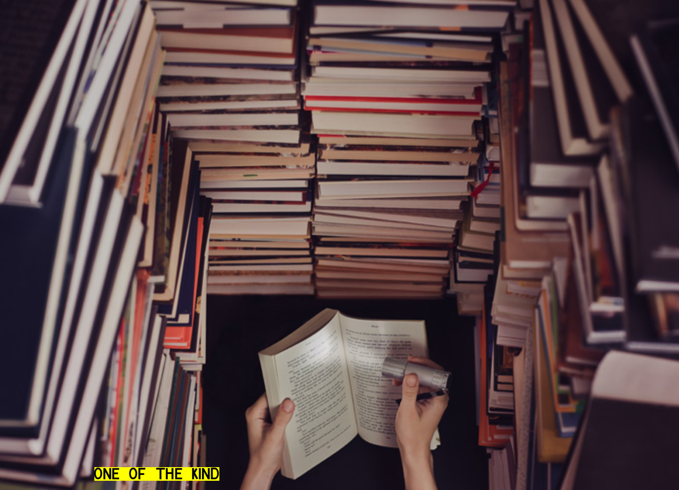
ONE OF THE KIND