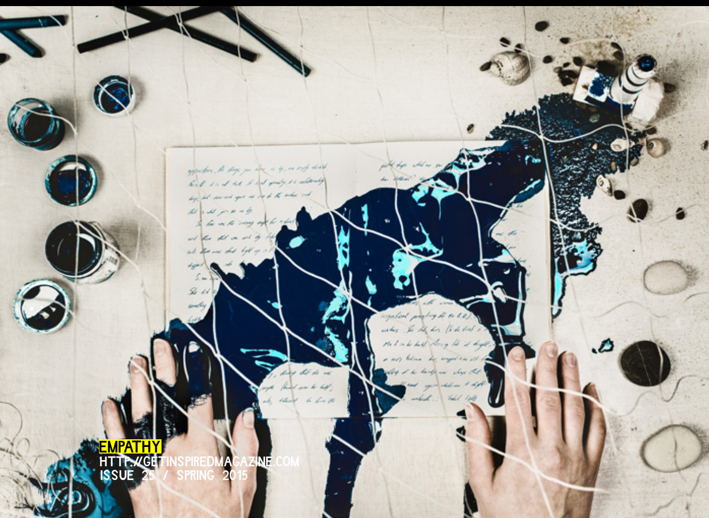
EMPATHY HTTP://GETINSPIREDMAGAZINE.COM ISSUE 25 / SPRING 2015