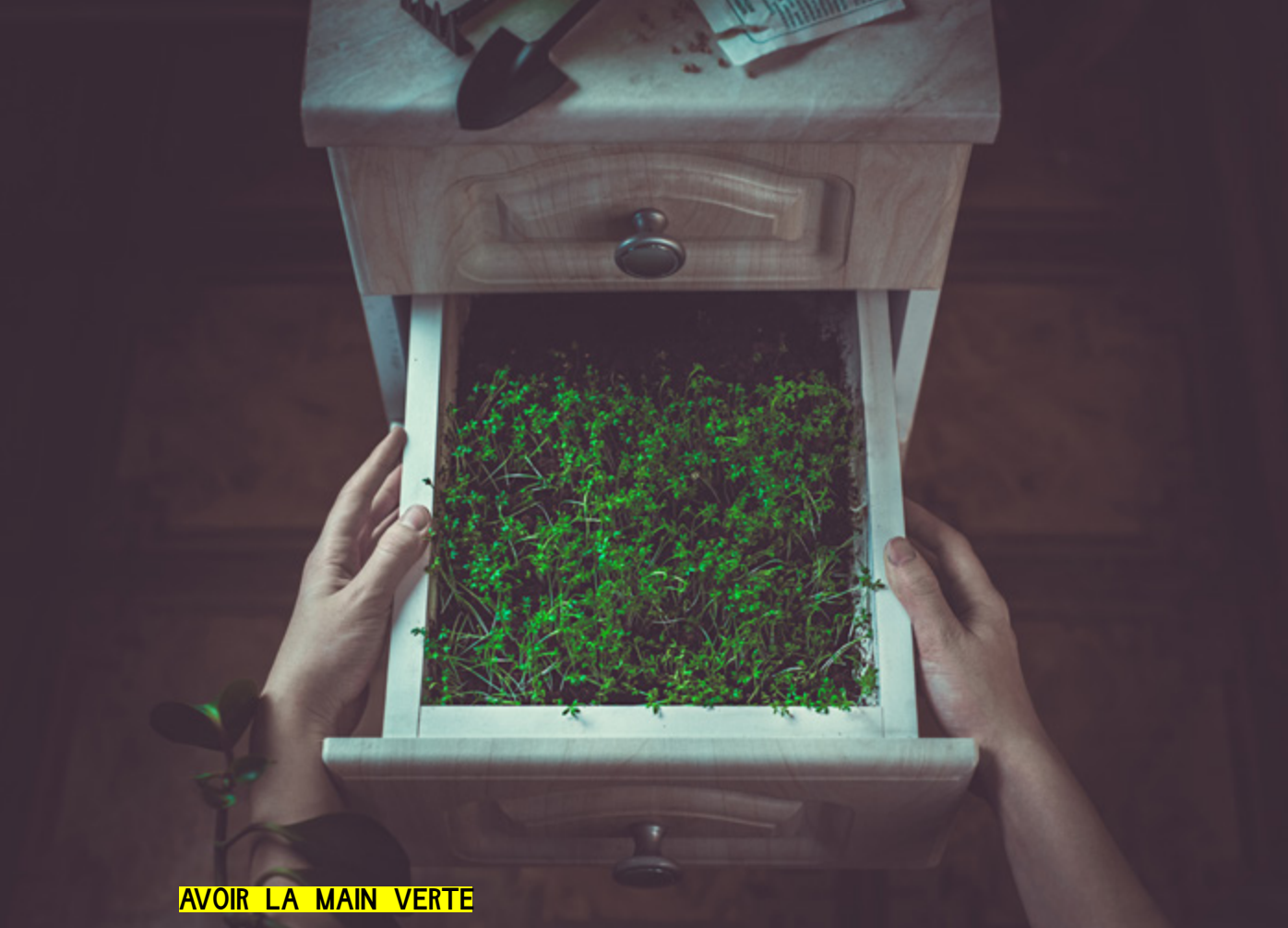
AVOIR LA MAIN VERTE